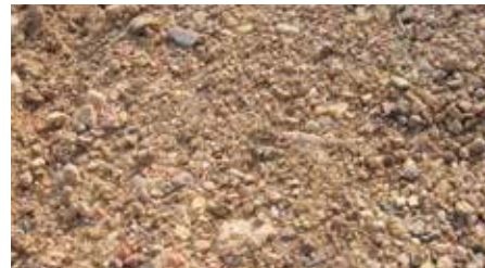
Sand / Gravel